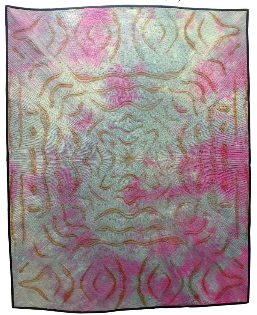
Exhibition and Publication History

(c) 2012-2019 Jean M. Judd/Artists Rights Society (ARS) New York Hand Stitched Thread on Hand Dyed Rust Pigmented Textile **Available for Purchase - $17,000**